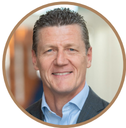
埃蒂纳·桑斯·阿塞多

Deputy Commissioner of China National Intellectual Property Administration